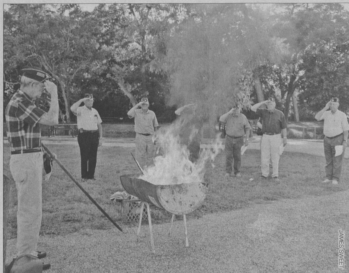
Pictured above are members of the American Legion Post #108 of Eagle Lake during its annual Flag Disposal Ceremony that was held Thursday, October 2.